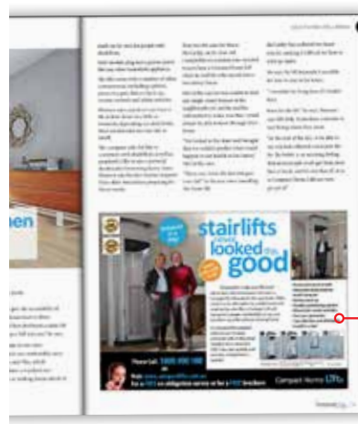
HALF PAGE 190mm x 125mm