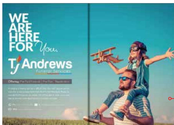
DOUBLE PAGE SPREAD 420mm x 297mm + 5mm bleed