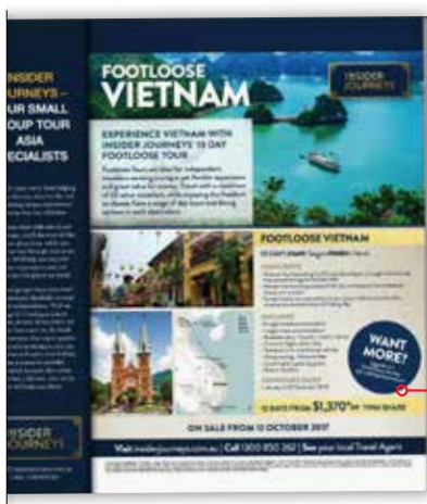
FULL PAGE 210mm x 297mm + 5mm bleed